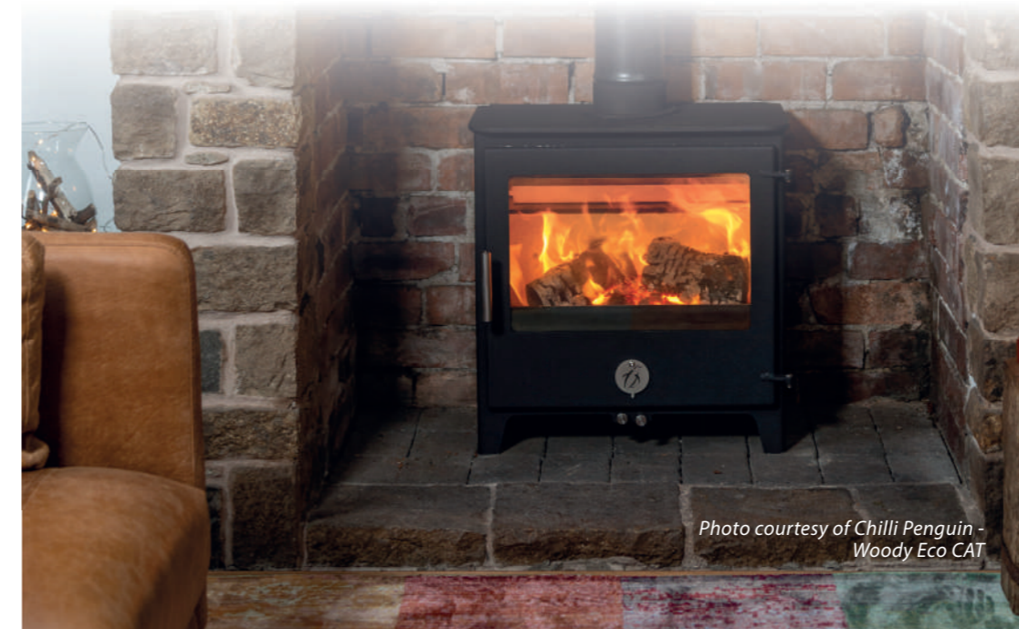
Woody Eco CAT

Fat Penguin Eco